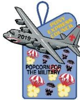
*this was 2019 patch